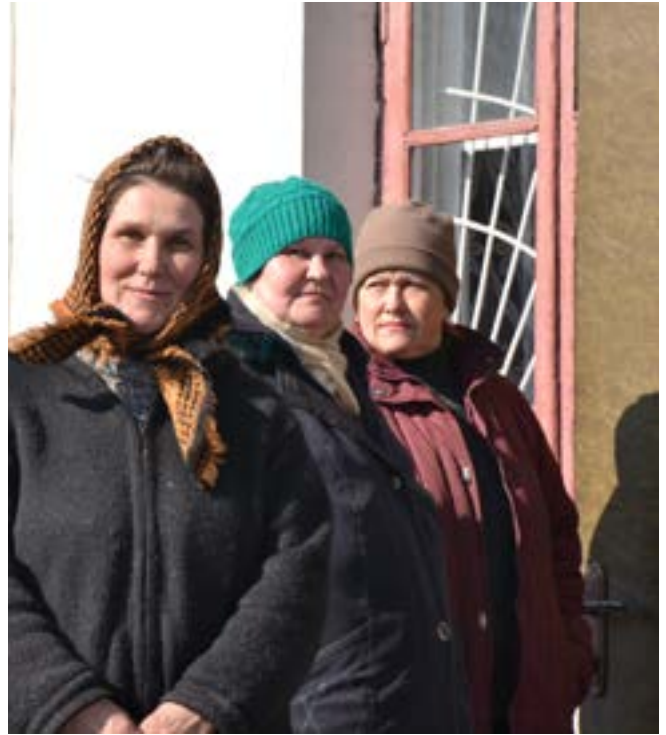
Internally displaced women in eastern Ukraine.

Despite the improvements in civil registration procedures outlined above, the system is still not comprehensive and continues to create obstacles for some IDPs. Unlike other Ukrainian citizens, who can apply for documentation at local registry offices, IDPs who cross the contact line from NGCAs