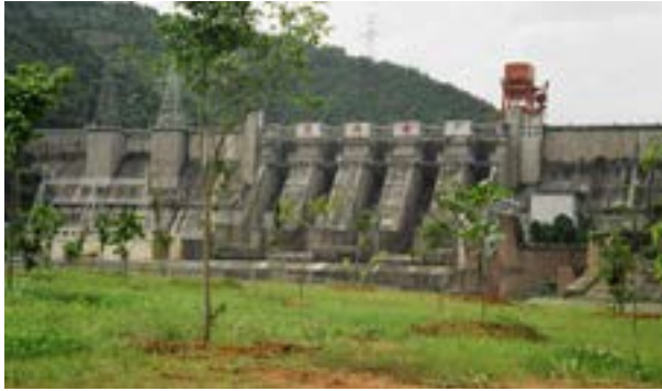
A view of the Manwan Dam on the Upper Mekong River, China.

In China, 86,000 dam projects displaced ten million people between from 1949 and 1984. A government survey showed that a third of the people affected by the projects were impoverished and a third experienced only a small improvement in their living standards. In acknowledgment of the situation, China's State Council issued national policy no.56 on post-relocation support.