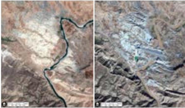
Sample satellite imagery of a dam construction.

to engage with local government in selecting a resettlement area or proposing alternative project areas. All volunteers need to know is how to take a photograph with a smartphone and agree to it being sent to the UN's Operational Satellite Applications Programme (UNOSAT) for analysis.