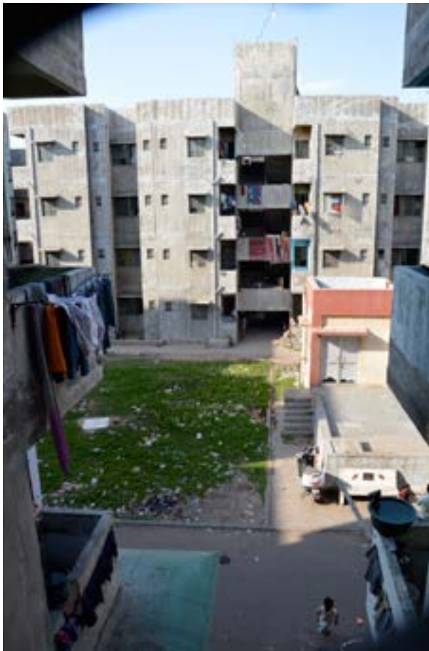
A view of the settlements provided to some of those affected by the Sabarmati Riverfront Development Project in Gujarat, India.

Others argued that international human rights norms should be the framework of choice since all countries report regularly to the UN on those common human rights standards. Not all participants use the Guiding Principles on Internal Displacement as the starting point for understanding how displacement caused by development work and its effects should be prevented and addressed. Further dissemination and discussion is required on the content and authority of the Guiding Principles, the UN Basic Principles and Guidelines on Development-Based Evictions and Displacement, and the IASC Framework on Durable Solutions for Internally Displaced Persons, and how they relate to displacement caused by development.