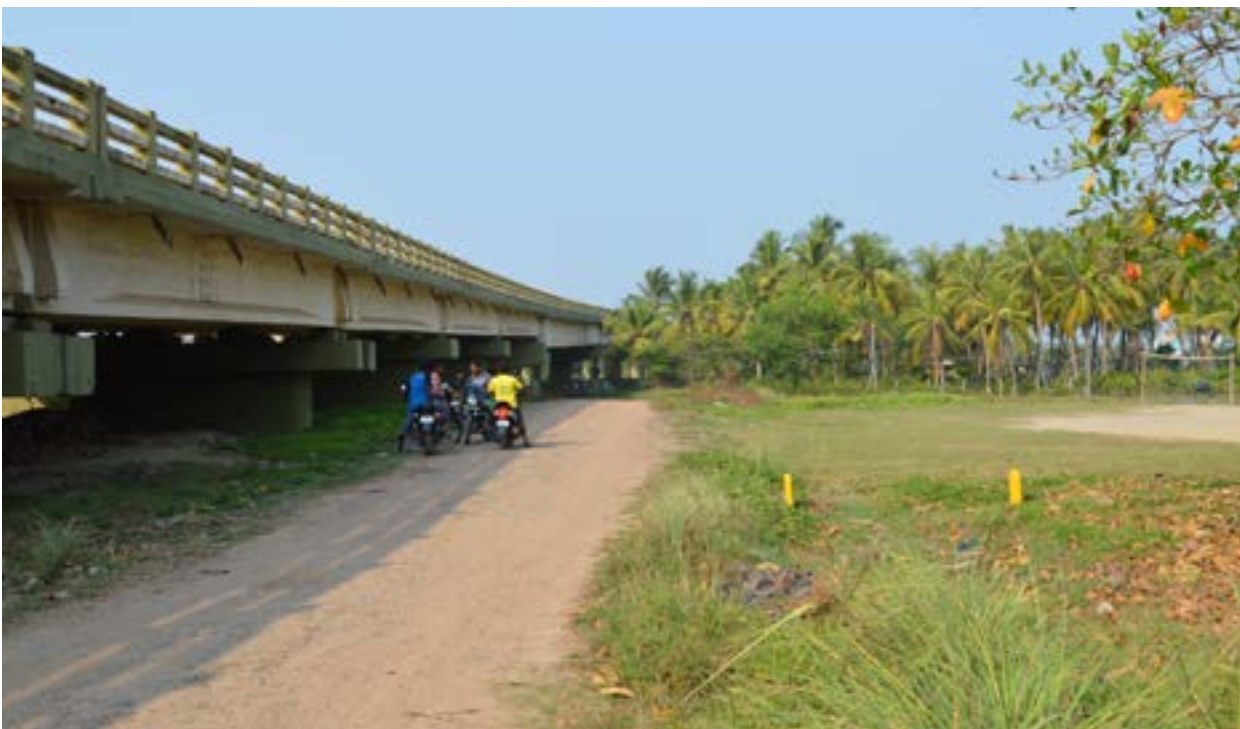
This road overpass was built to transport cargo from the International Container Transshipment Terminal in Kochi, Kerala, India. Dividing the island of Moolampilly in two, the overpass project affected 326 families, either through loss of their home, part of their land or property, or their livelihood options.

Other global findings suggest that levels of social tension, robbery, divorce, prostitution and mental illness also tend to be higher among those displaced. Host communities lose land for resettlement and can also lose their identity or find it diluted. Losses need to be disaggregated within and between communities to properly understand overall impacts. Few studies quantify these social and other environmental material and non-material impacts of displacement and resettlement.